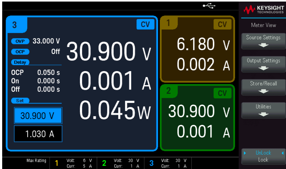
Figure 2. View details of a single channel including the measured power, OVP/OCP condition, and delays.

Figure 2 shows the single-channel view that includes the measured power, OVP / OCP condition, and delays. You can also monitor the readback, voltage and current for the other two channels.