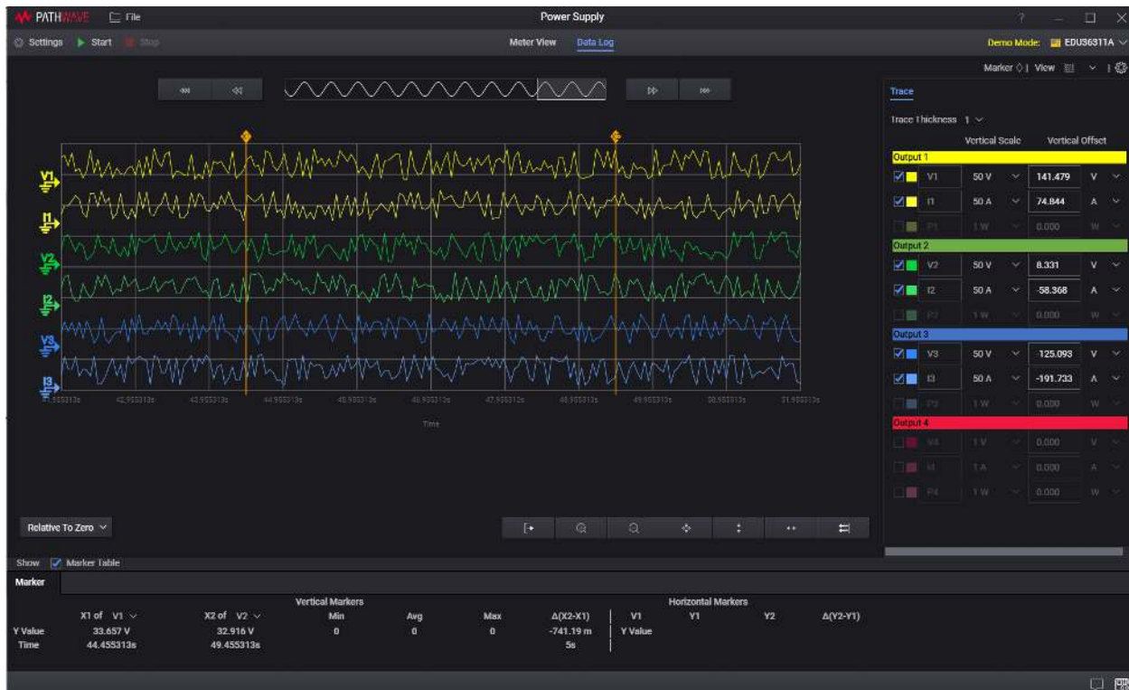
Figure 3. Data-logging with PathWave Benchvue software for the PC