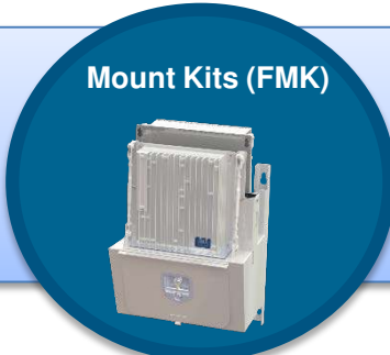
Mount Kits (FMK)