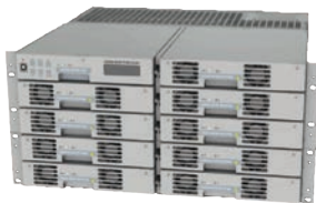
Sageon II Bulk