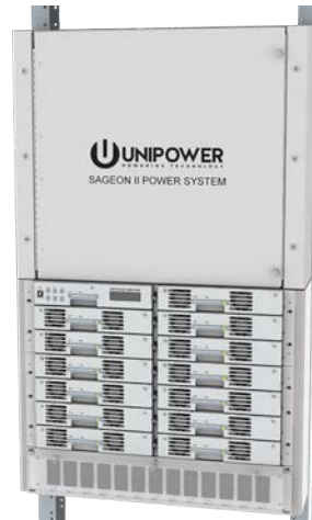
Sageon II PMD